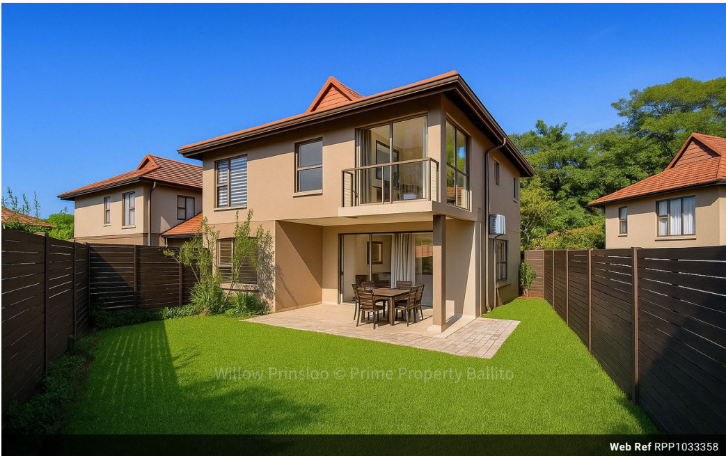
Willow Prinsloo © Prime Property Ballito

Shop 5 7 on Millennium Boulevard Umhlanga Ridge 4321